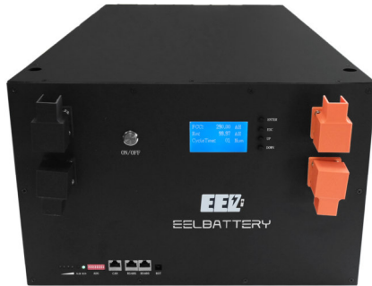
Power Wall Case