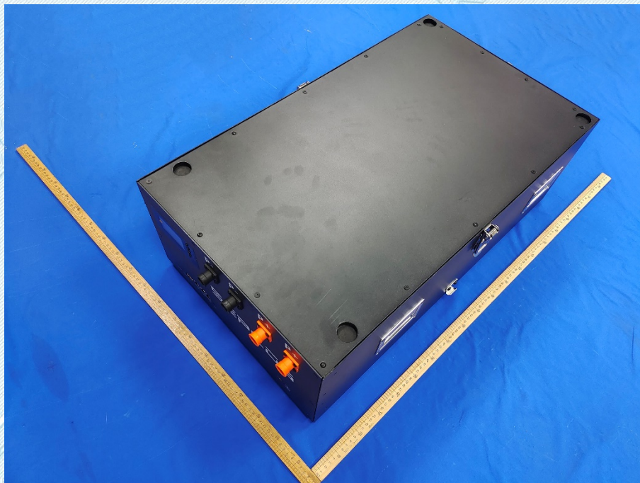
Figure 1 Overall view