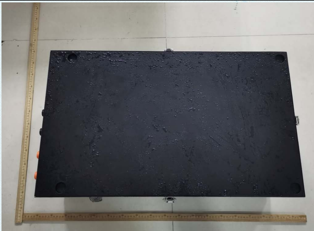
Figure 4 Product view after IPX3 test