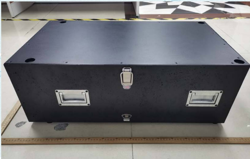
Figure 5 Product view after IPX3 test