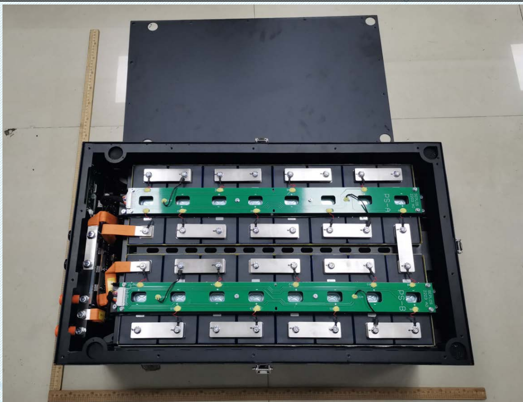
Figure 6 Internal view after IPX3 test