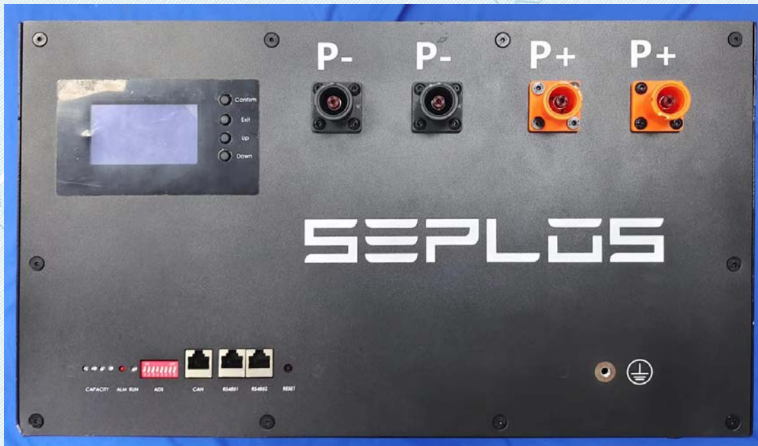
Figure 3 Port view