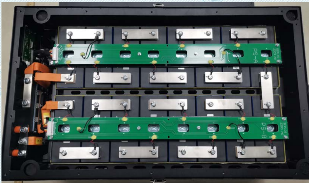
Figure 7 Internal view after IPX3 test